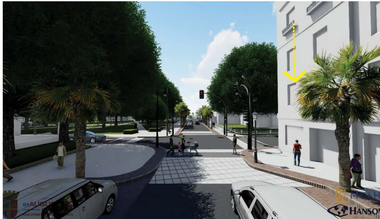
Concept A rendering shown above. Additional renderings for Concept A and B are available on the project website.