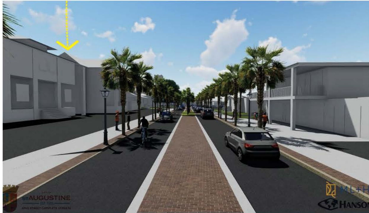
Concept A rendering shown above. Additional renderings for Concept A and B are available on the project website.