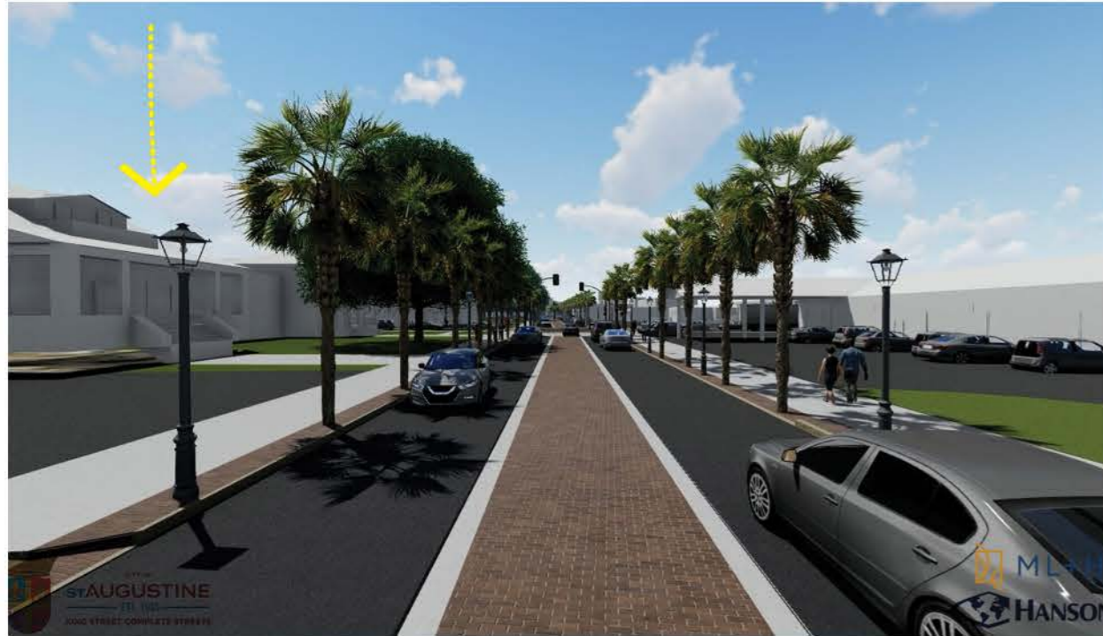
Concept A rendering shown above. Additional renderings for Concept A and B are available on the project website.