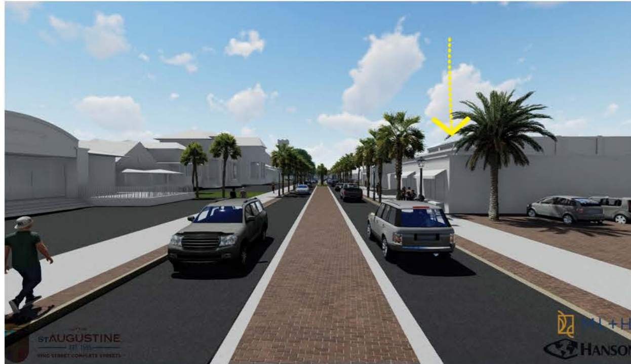
Concept A rendering shown above. Additional renderings for Concept A and B are available on the project website.