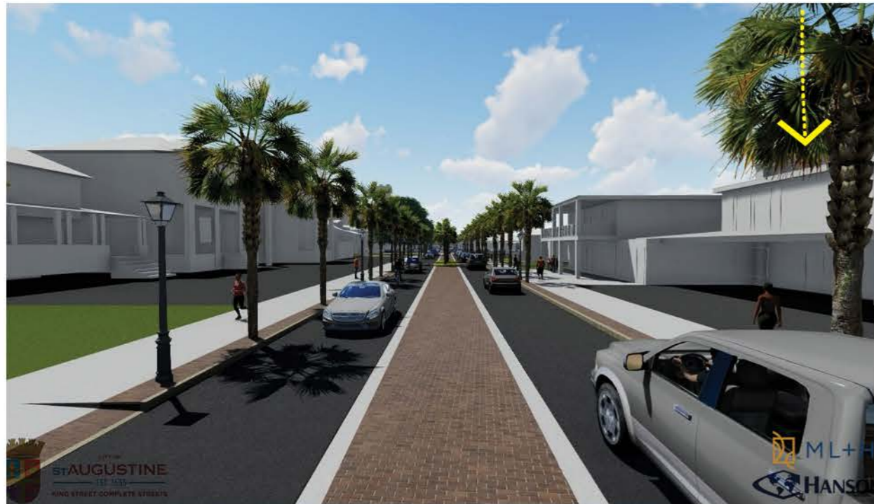
Concept A rendering shown above. Additional renderings for Concept A and B are available on the project website.