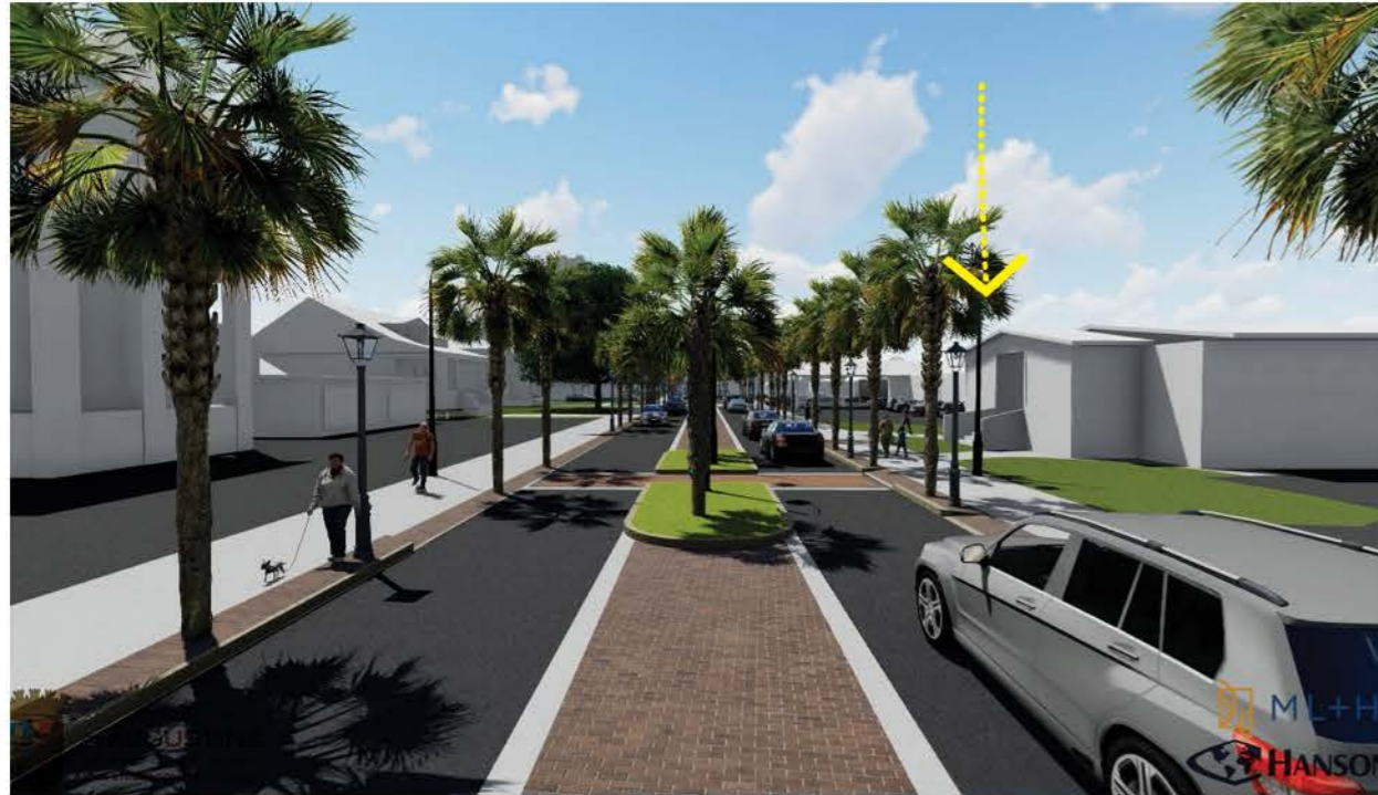
Concept A rendering shown above. Additional renderings for Concept A and B are available on the project website.